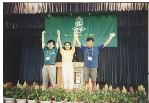
Love of the Earth 2000

The following prominent projects were organized in the past: