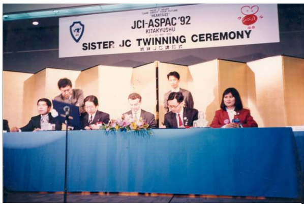
Sisterpact signing with Wakayama Junior Chamber

JCI organizes the World Congress and Asia Pacific Area Conference (ASPAC) Conference every year. It offers an excellent opportunity to our members to develop friendship and exchange JC experience with other overseas JC members.