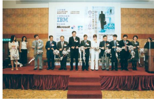
Skills and Tactics for Small and Medium Businesses

We also offer opportunities for members to pursue business interest through the “National Business Network” of JCIHK as well as JCI networking activities. In addition, we organized special business seminars with well-known speakers for our members. Sha Tin Junior Chamber organized “Opportunity of Establishing eBusiness”.