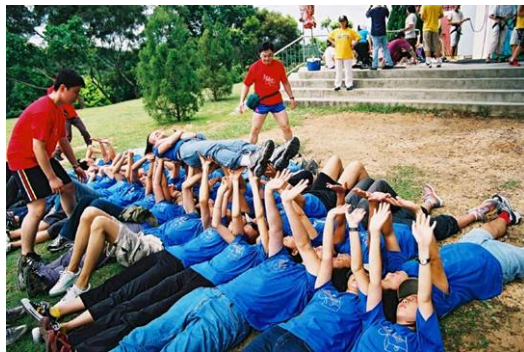
Mental Health Camp & Training Workshop

SJC offers leadership workshops and training programs on goal setting, time management, public speaking, parliamentary procedure, protocols, etc. for members. Thereby equip our members with necessary techniques to become future leaders of our community.